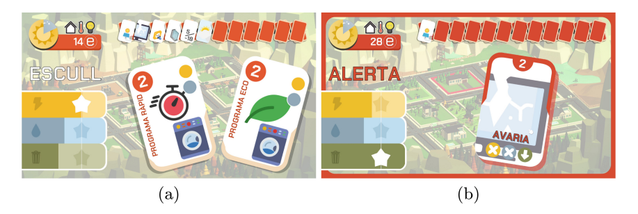
Fig. 1. The two types of situations that may appear in the game: (a) Pick Situation , (b) Event Situation .